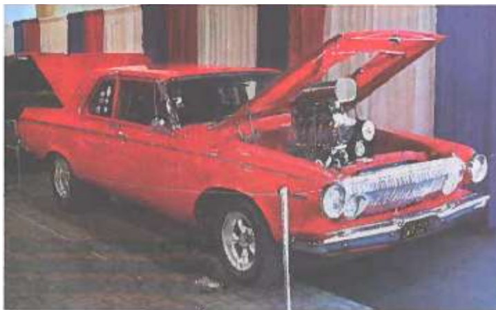
Chuck Merken had his '63 Dodge "Big Red" captured in the May 2019 issue of Drive as part of their Grand National Roadster Show coverage (more on Page 7)