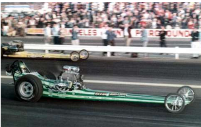
1969 Winternationals Top Fuel Winner, Beebe & Mulligan