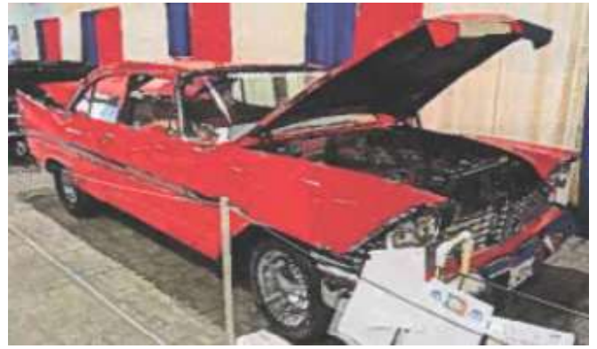
Sil Brander's 1959 Plymouth Belvedere