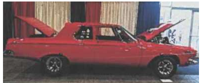
Chuck Merken's 1963 Dodge 330