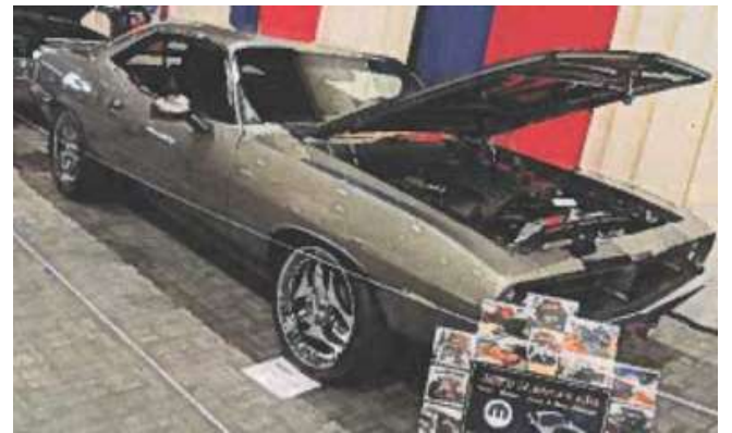
Lonnie Clabaugh's 1970 Plymouth Barracuda