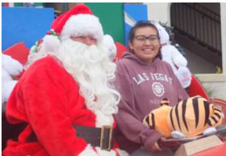
Number one in line