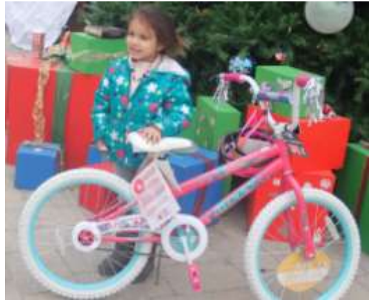
A couple of happy bike winners