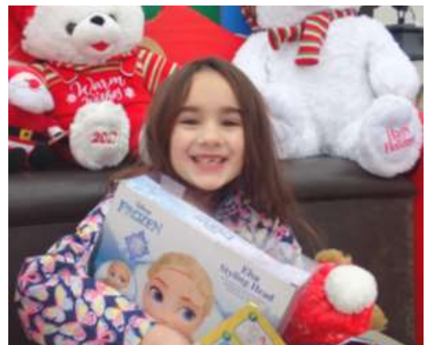
Kind of makes it worth while