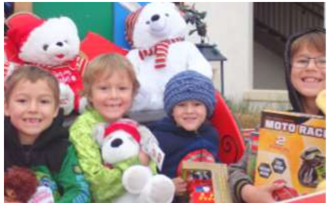
When was the last time you saw this many smiling faces? Lots of missing teeth. To be young again...