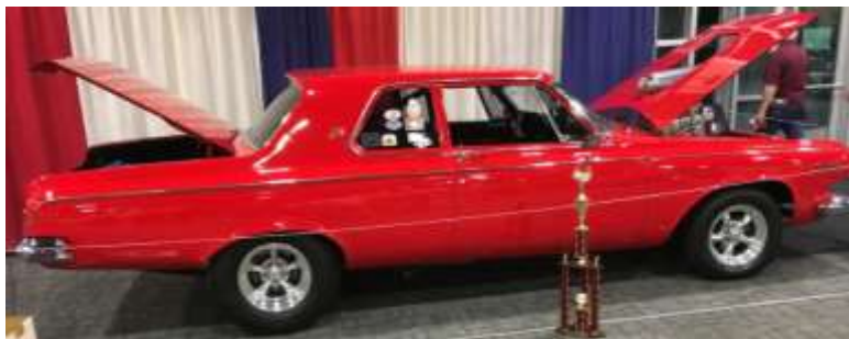
Chuck Merken - '63 Dodge 330 Class: Domestic Bracket Racer First Place