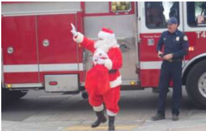
Santa arrived by fire truck

Partial toy staging area. Remember the photos of all the boxes piled in the room from the December newsletter? This is just a portion of what came out of those boxes prior to 2:00.