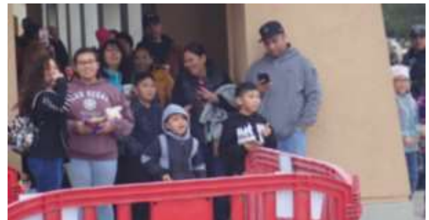
Not sure how long they had been there, but here is the beginning of the line