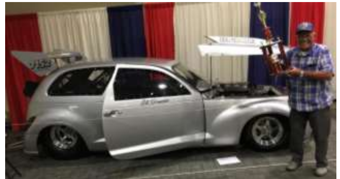
Sil Brander - '07 PT Cruiser Class: Super Gas First Place