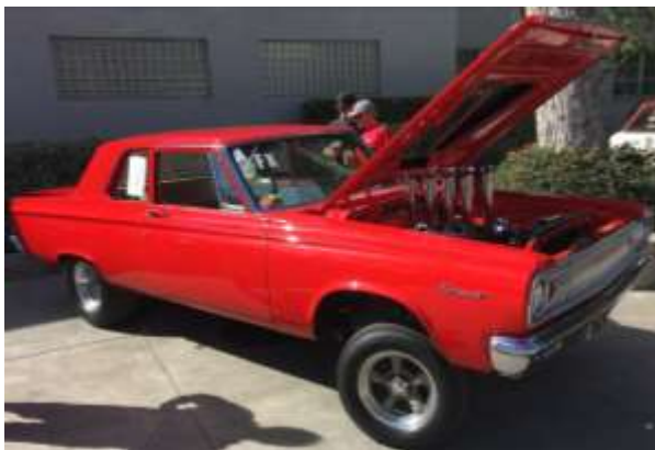
Not a lot of Mopars at the Saturday Drive-In but this '65 Coronet was outstanding & it could have been yours for a measly $57,000