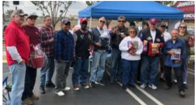
Give away winners as well as the show & shine picks