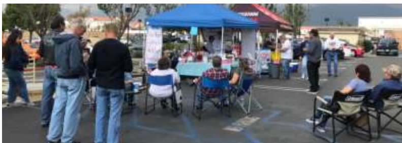
Left: awards & drawing gathering. Everyone who showed up is a star in the toy drive book. Thank you.