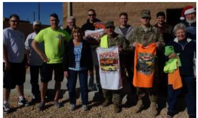
Unloading crew with a few t-shirts of appreciation