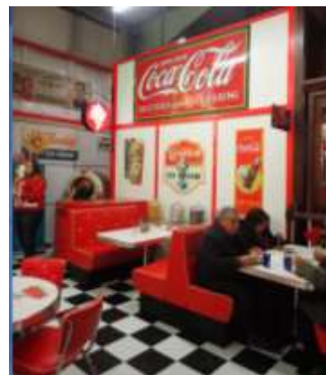
Ice Cream/Soda Fountain