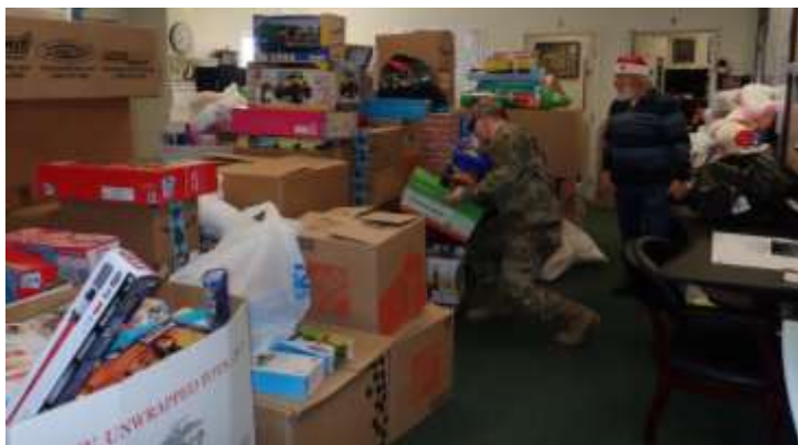
"Santa" out of his red uniform & long white beard