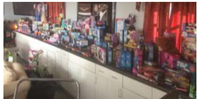
This does not include the Chaffey College donations or the Ramona Tire donation