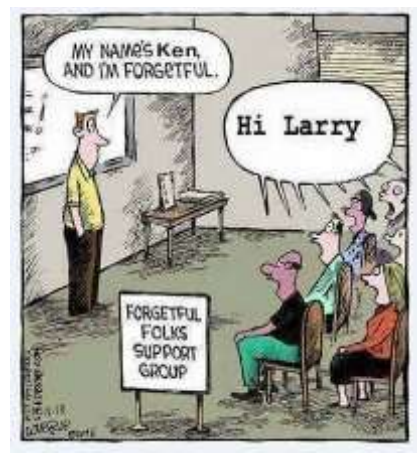
You can almost see the resemblance.