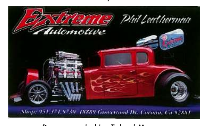
Recommended by Inland Mopars