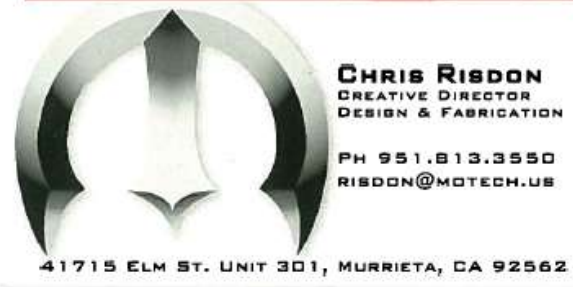
They do very nice work