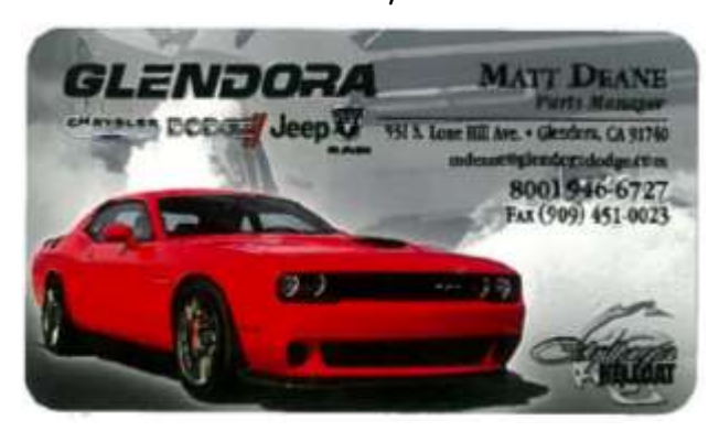
Mention Inland Mopars & get a 10% discount on parts