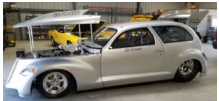
'07 PT Cruiser, 572 CI grocery getter (Sil Brander)