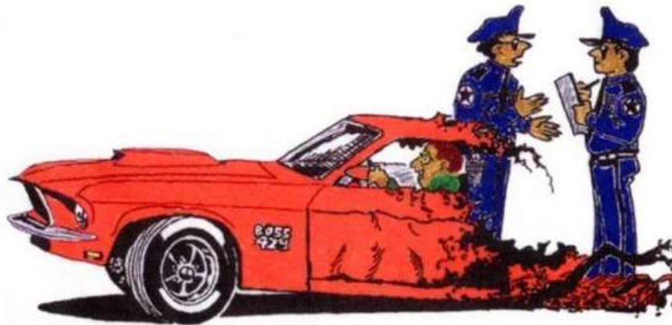
"The viciousness of the bite pattern would suggest a Barracuda attack."