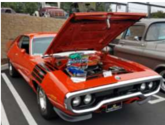
Below: Top 5 Musclicar, 6 th Annual Whittier Area Classic Car Show, February Right: Best Musclicar, 6 th Annual Bonita High School Auto Shop Car Show, La Verne, March