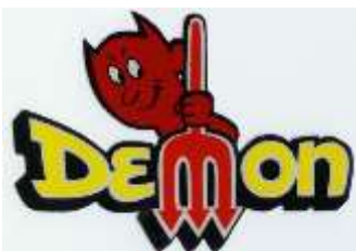
1971-72 Dodge Dart Demon Logo