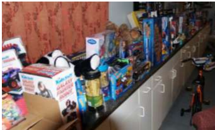
Toys as far as the camera lens can see