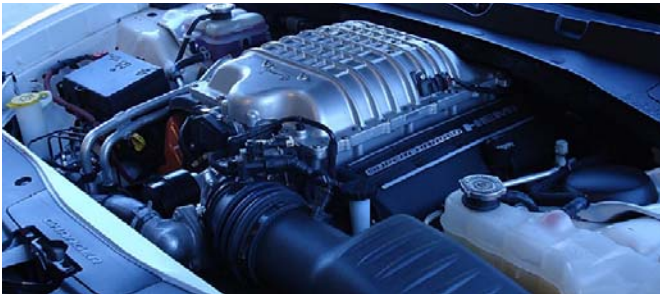
Hellcat Charger photos from Viau Motorsports November 21, 2015

Haven't seen the January meeting minutes and the formatting is not doing what I would expect it to, so will make this short. Several flyers are attached with upcoming events for your info. Some of these we will be attending while others are in addition to the monthly club events. You should be able to find something to do.