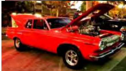
Left: Chuck & Linda Merken 1963 Dodge 330 1 st Place Street/Strip Modified